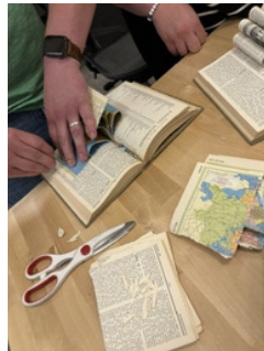
Book vases at Monday Makers