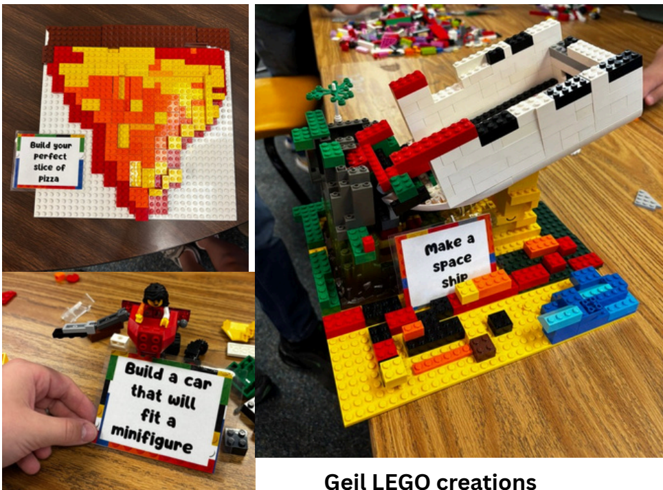
Geil LEGO creations