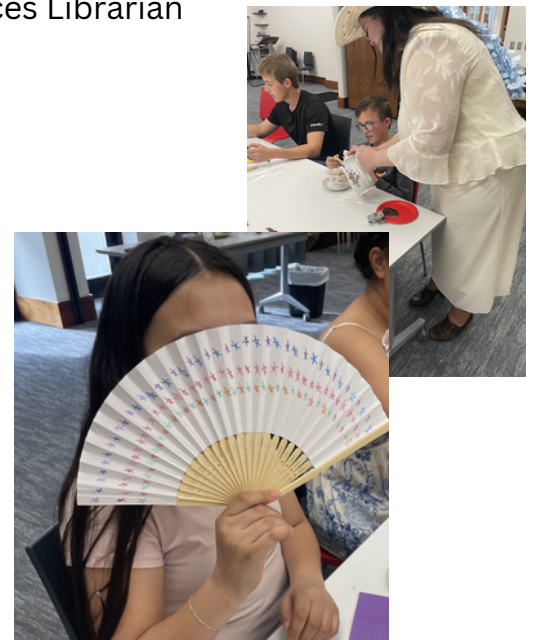
Bridgerton Tea Party